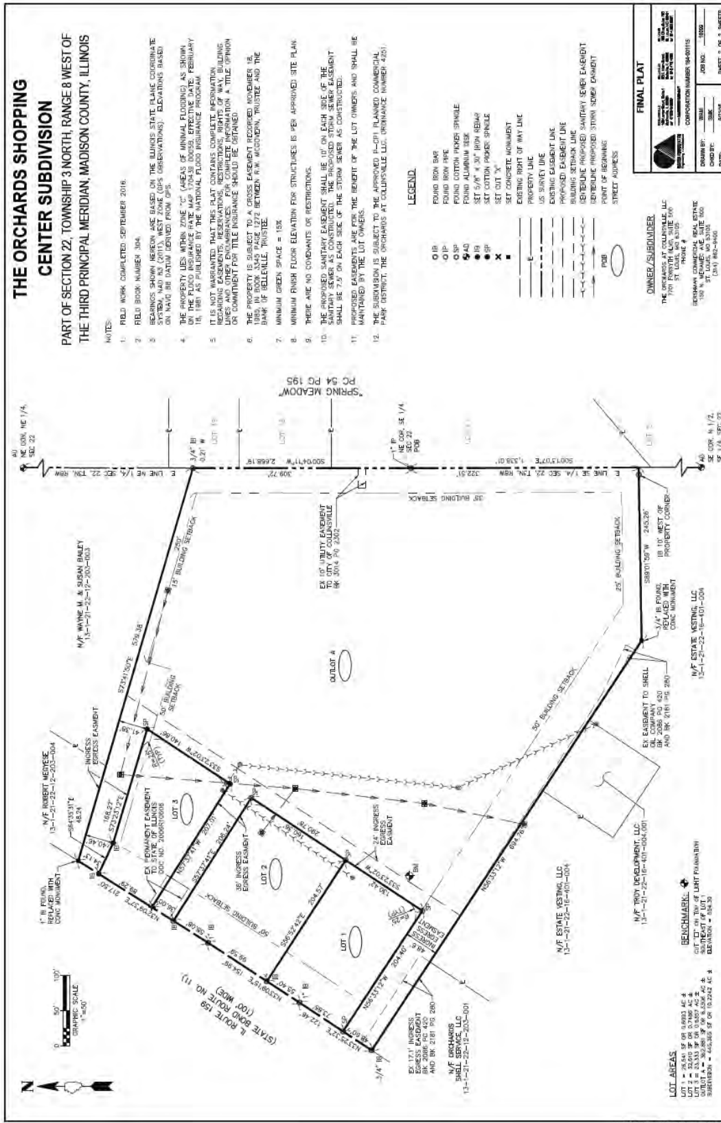
EXHIBIT B: FINAL PLAT